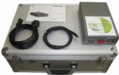
PWM 20 encoder diagnostic kit

The PWM 20 phase-angle measuring unit serves to check and adjust encoders with absolute and incremental interfaces.